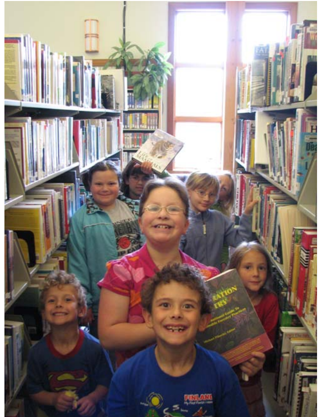
Kids search and find books about nature, music, jokes, rockets, and more in the non-fiction section