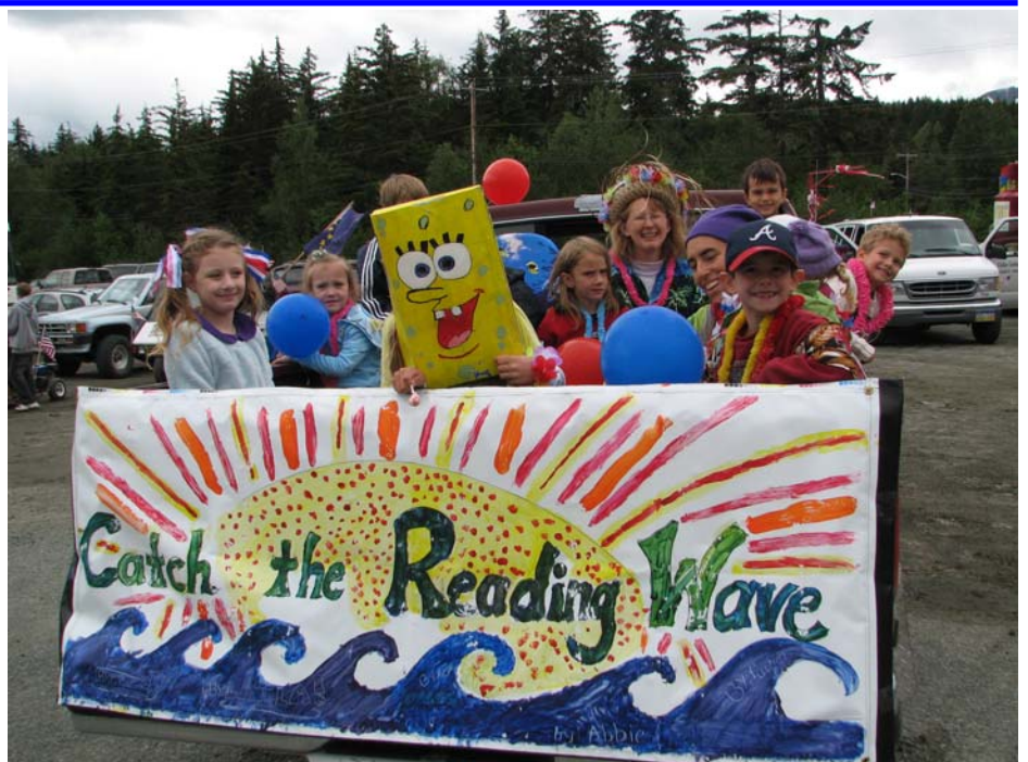
Kids painted the "Catch the Reading Wave" sign at the library, and then waved balloons and wore cheerful wave-catching costumes for the Fourth of July pa-